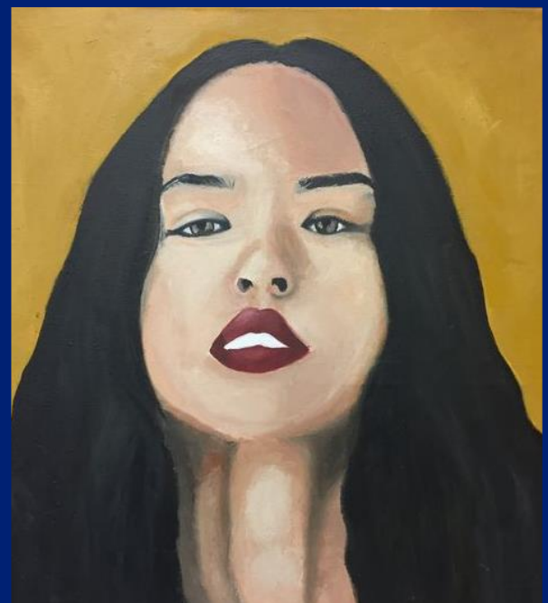
Student final piece 2018

https://www.bbc.co.uk/bitesize/subjects/z6hs34j