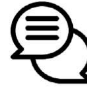
Response to feedback