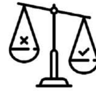
Behaviour & engagement